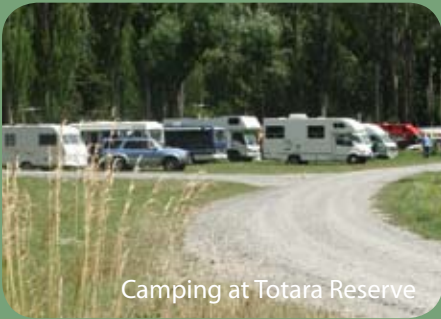
Camping at Totara Reserve

The park offers powered sites for caravans and campervans, plenty of open space for pitching a tent, and toilet and showering facilities. Highland Home Christian Camp, Camp Rangī Woods, and nearby private accommodation offer alternatives to 'roughing it'.