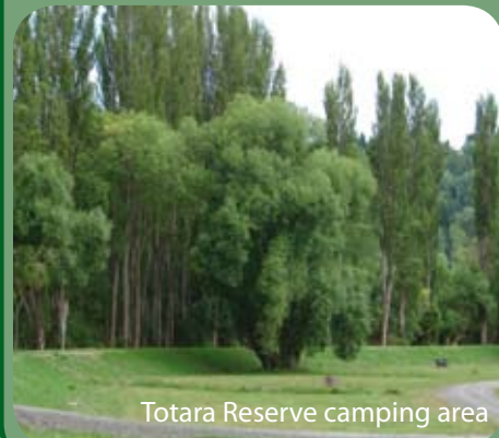
Totara Reserve camping area

Picnic tables, shelters and barbeques are provided so visitors can enjoy a leisurely lunch or an informal dinner while taking in the sights and sounds.